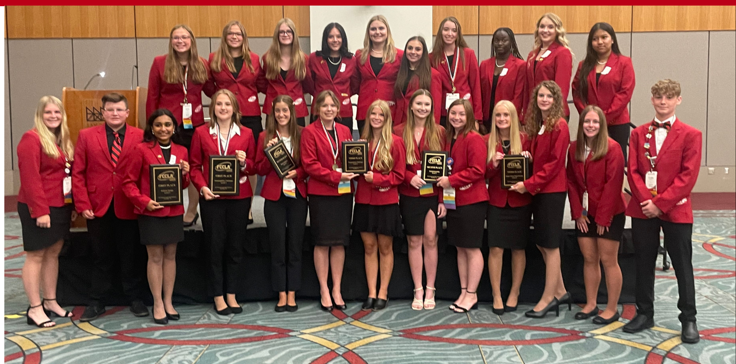
2022 National Leadership Conference Top Ten Finalists from Indiana

Family, Career and Community Leaders of America (FCCLA) is a national non-profit student organization that helps youth develop leadership and workplace skills to prepare for both college and careers through peer-to-peer education, community engagement, and the application of skills learned in the Family, and Consumer Sciences (FCS) classroom.