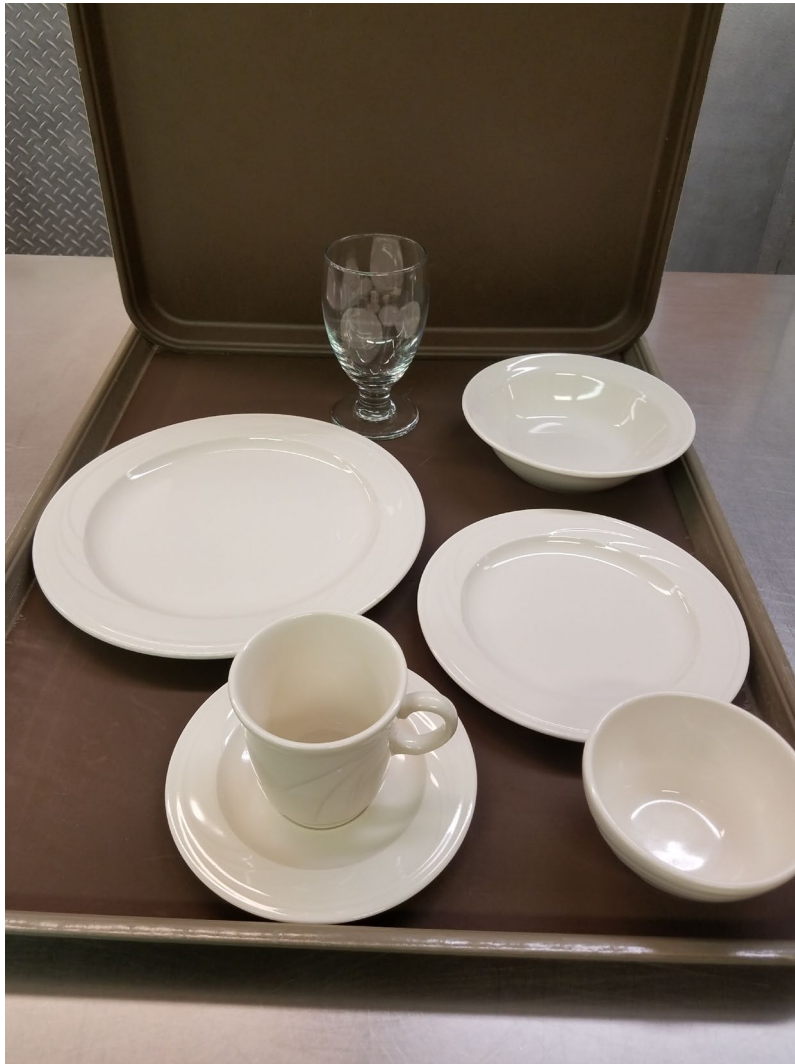
Overview of all dishes and glassware